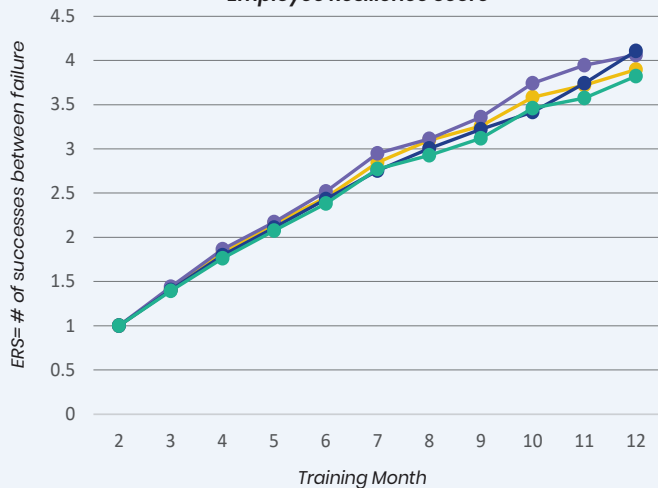
Employee Resilience Score

400% Improvement In Employee Resilience Score